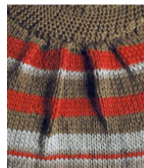
rollover to enlarge