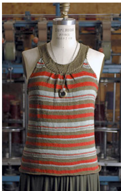
rollover to enlarge